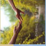
Dreams Come True